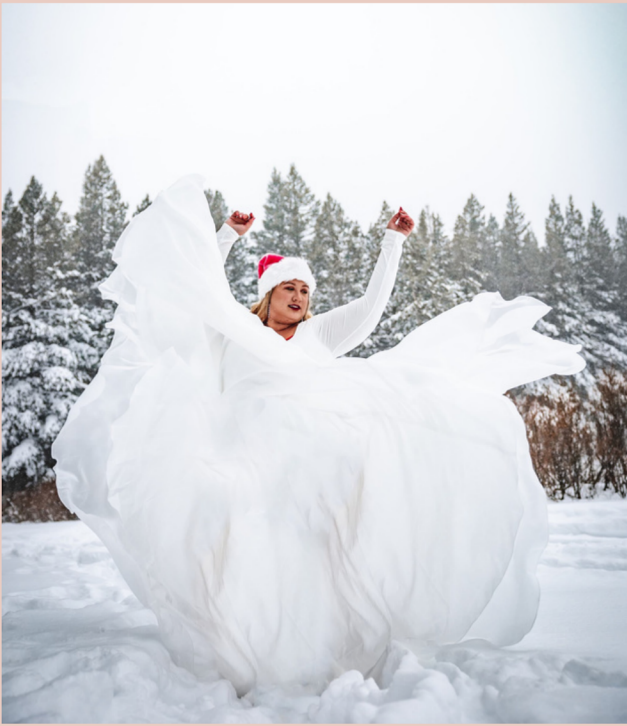
Mt. Rose, NV