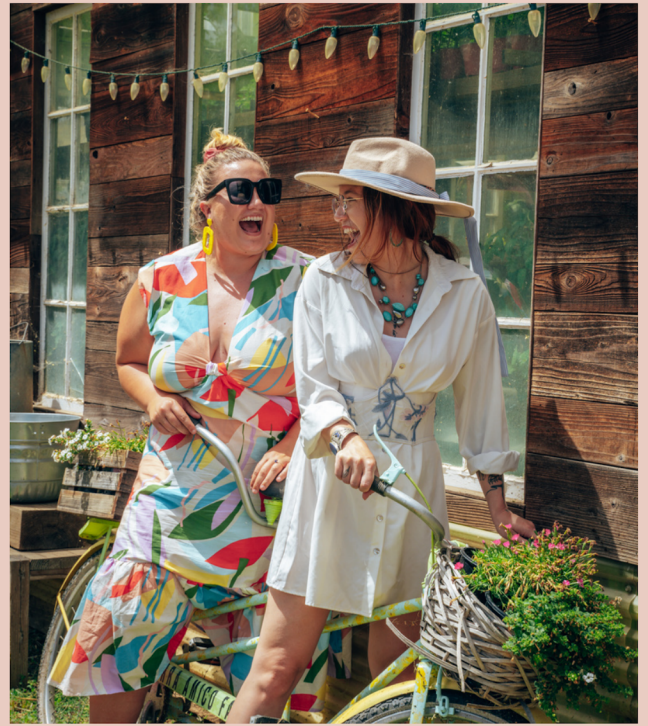
Morgan Hill, CA